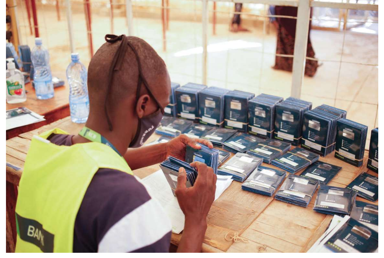
\hbox{ Kenya Commercial Bank staff open bank accounts for refugees at Kakuma camp.}\\