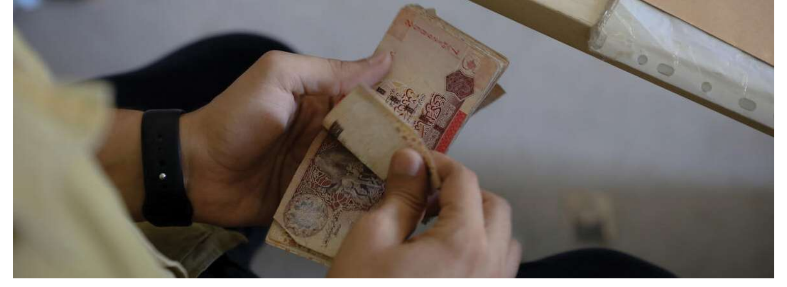
Cash assistance to asylum seekers in Libya.

Two extra enabling factors favour inclusion in government COVID-19 social protection responses: