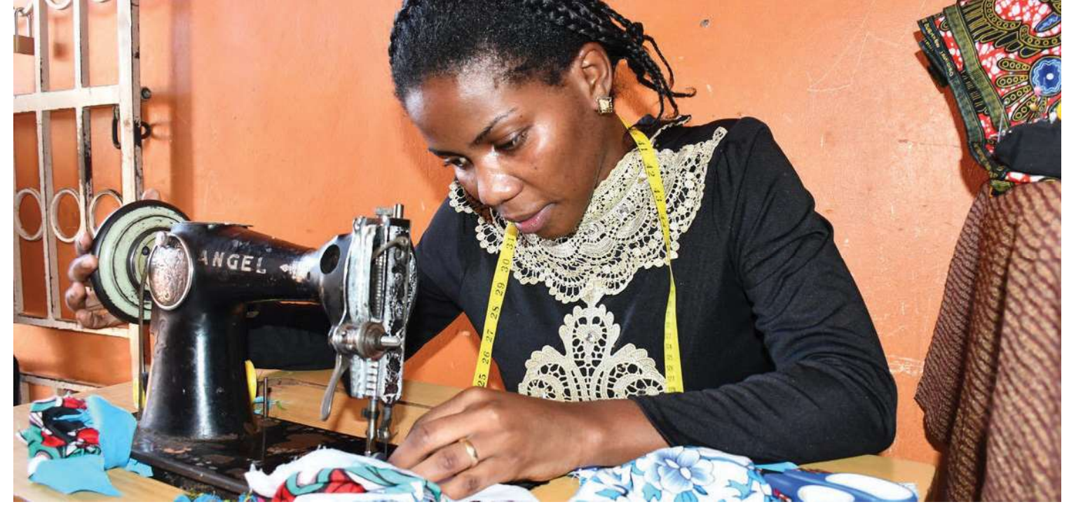
Business support to Congolese refugee in Uganda.