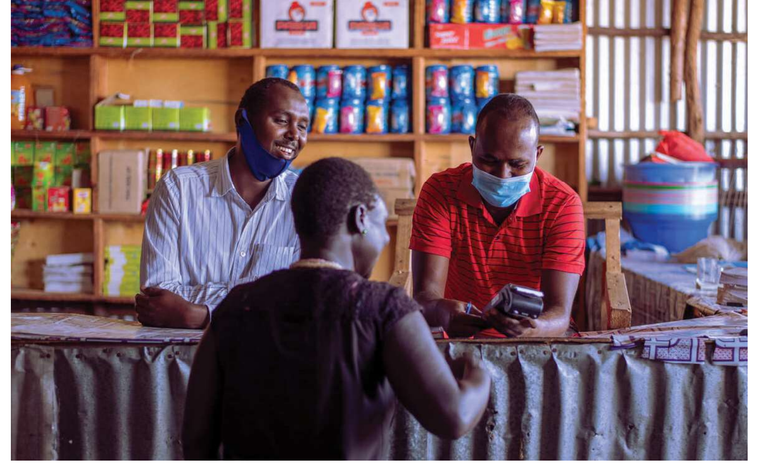
Validation of an ATM card in the Kalobeyei Settlement, Kenya.