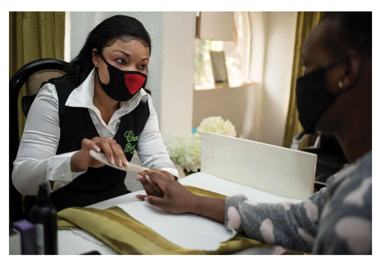
Refugee beauty salon entrepreneur in Pretoria, South Africa.

4. Enrolment to the government social registry. Social registries are normally the gateway for receiving any form of social protection benefit, functioning as information systems supporting outreach, intake, registration and determination of benefits, as demonstrated in South Africa. International donors supporting the reinforcement and scale-up of government social protection systems are systematically prioritising the development of social registries to help harmonise fragmented social protection programmes. For example, development and scale-up of the social registry is prioritised in the WBG IDA18 RSW projects in Djibouti, Cameroon and the Republic of Congo. Inclusion of refugees in Djibouti's social protection system has been initiated with the enrolment of refugees to the national social registry that makes them eligible to receive the government's COVID-19 benefits. In Kenya, preparations are underway to reinforce the national social registry to include refugees at a later stage. Some governments that