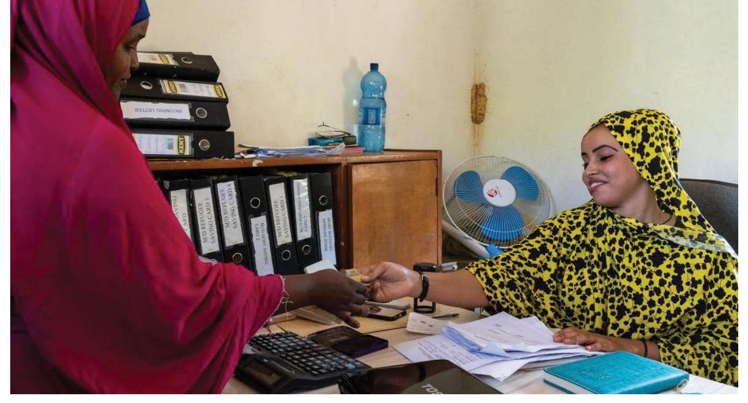
Microfinance office offering loans to refugee and host community entrepreneurs in Ethiopia.

Additional Financing (P174556, US$15 million). Around 1,000 urban refugee households are being biometrically enrolled into the government social registry to access COVID-19 vouchers supported by UNHCR. A further 500 refugee households will be eligible for the social registry. While refugees are excluded from the project's cash transfers and economic inclusion activities, they are eligible for community-level communication sessions on COVID-19 prevention and child nutrition, health, education, child stimulation and parenting, and gender-based violence (GBV).