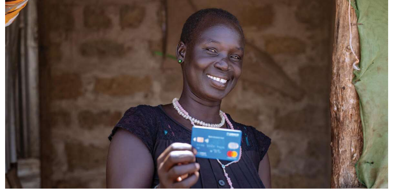
Bank ATM card used to receive Cash Assistance from UNHCR in Kenya.