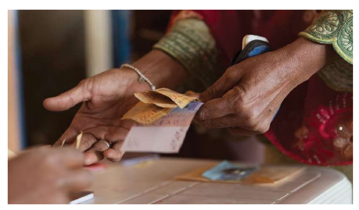
Cash assistance to refugees in Burkina Faso.

Rwanda: The government's National Social Protection Policy (2017) is being rolled out via its Social Protection Sector Strategic Plan (2019-2024). Non-contributory programmes include the poverty-reduction flagship Vision 2020 Umurenge Programme that includes social assistance benefits, the Genocide Survivors Support and Assistance Fund and the Rwanda Demobilization and Reintegration Commission. Contributory schemes include complementary livelihood support services and Community-Based Health Insurance ( Mutuelle de Santé ).