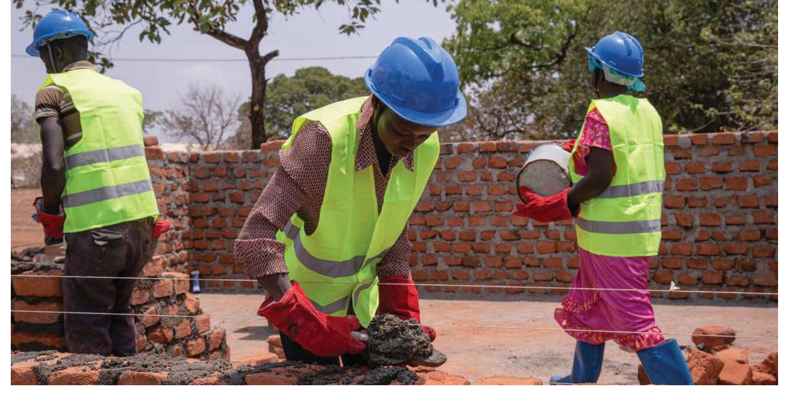
South Sudanese refugee working in construction at the Bidibidi settlement in Uganda.