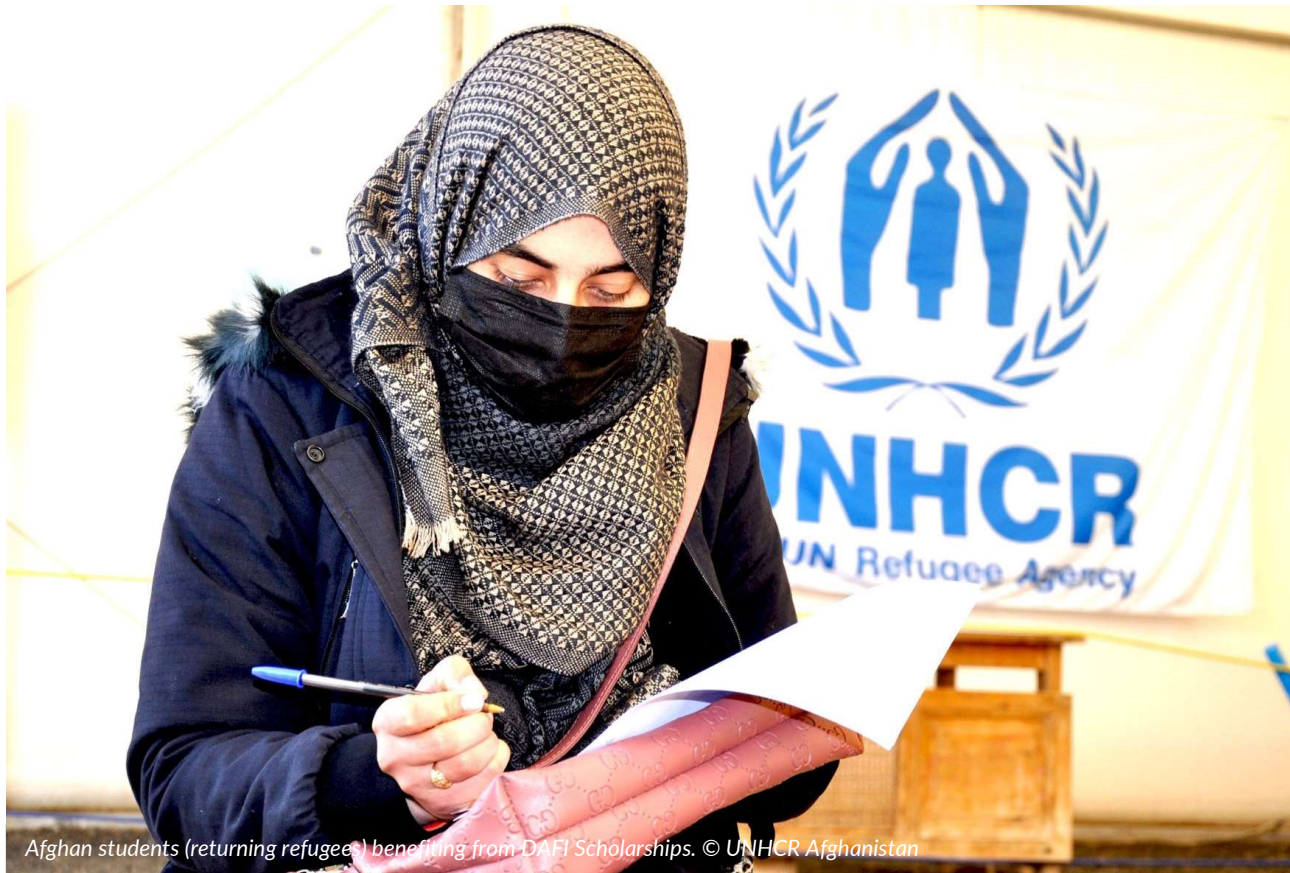
Afghan students (returning refugees) benefiting from DAFI Scholarships.