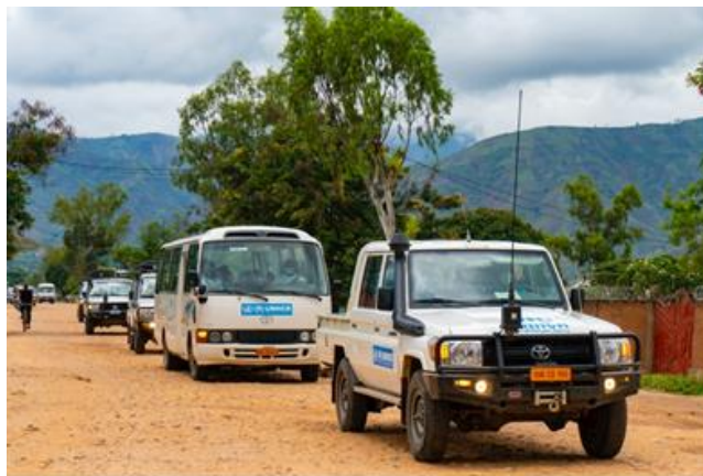
A convoy with Burundian refugees travels from the Kavimvira transit centre to the border post between the DRC and Burundi.