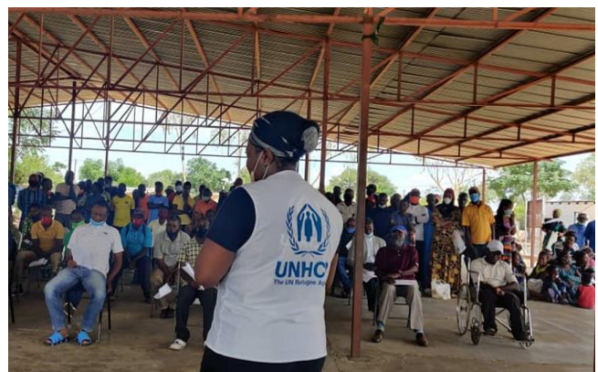
UNHCR Senior Legal Officer addresses the townhall meeting in Osire refugee settlement, Namibia.