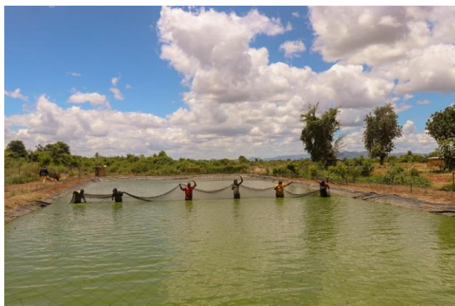
Members of the fishery project in Tongogara refugee camp, Zimbabwe working in one of the ponds.