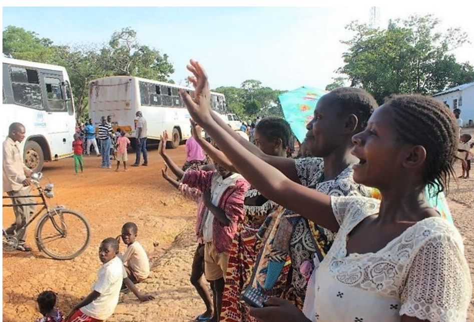
A voluntary repatriation convoy departing Mantapala refugee settlement, Zambia, in December 2021.

COVID-19: Fully vaccinated refugees, asylum-seekers and internally displaced persons (IDPs) doubled over two months.