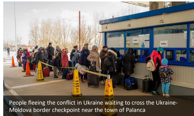
People fleeing the conflict in Ukraine waiting to cross the Ukraine-Moldova border checkpoint near the town of Palanca

WFP IS WORKING WITH THE MOLDOVA GOVERNMENT, UNHCR, IOM AND EUCPT TO PRODUCE AN ESTIMATION OF POSSIBLE REFUGEE INFLUX PEAK SHOULD THE SECURITY SITUATION IN SOUTHERN UKRAINE DETERIORATE