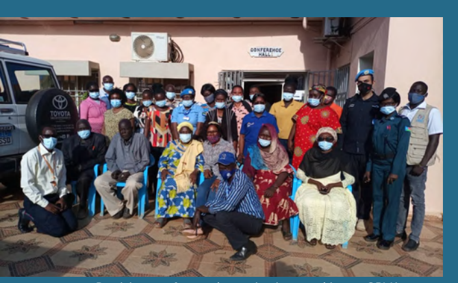
Participants of several organizations working on GBV issues.

The GBV Prevention, Response and Mitigation Standard Operating Procedures (SOPs) for Western Bahr El Ghazal was reviewed during a workshop in Wau. 24 representatives from different organizations participated in the exercise, including line ministries, chiefs, police personnel, women lawyers association and women led organizations. The draft SOPs has incorporated the recommendations drawn from several assessments conducted in the state, aiming to strengthen the support to GBV survivors.