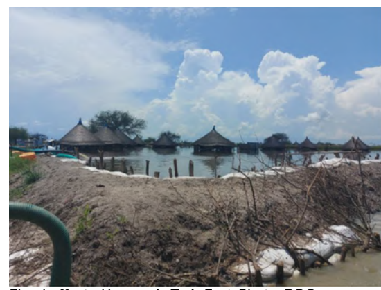
Flood-affected houses in Twic East.

In October, violence in Tonj East led to fatalities as part of the ongoing conflict between Luachjang and Rek Dinka communities. In Tonj North, a series of fatal incidents were reported between Leer and Nyang Akoc sections that led to multiple fatalities. Fighting between armed groups in Kupera and Dongoro payams in Lainya County displaced persons to the neighboring villages and others to Uganda seeking safety. Humanitarian organizations relocated seven staff members from Wuji/Limuru to Limbe and suspended health outreach activities. In Pibor, humanitarian organizations relocated their staff due to threats of youth groups on demands for employment.