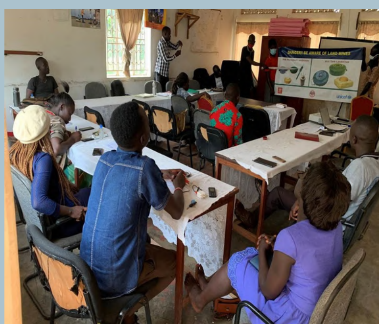
IPCS staff undertaking EORE refresher training to build their capacity as facilitated by Save Lives Initiative.

From September 2021 to-date, four NNGOs have benefitted from this activity: (1) Institute for Promotion of Civil Society (IPCS) in Yei, Central Equatoria, which has four teams comprised of ten males and six females; (2) the Mobile Theatre Team (MTT) implementing in Renk and Melut, Upper Nile, which has two teams (seven males and one female); (3) the Community in Need Aid (CINA) based in Magwi, Central Equatoria which has one team (one female and three males); and, (4) Save Lives Initiative's (SLI) six teams (16 males and 12 females) conducting EORE in Lainya and Terekeka, Central Equatoria as well as Tambura and Mundri, Western Equatoria.