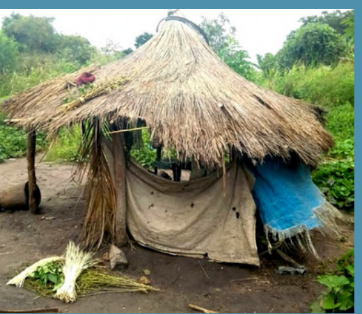
One of the tukuls before reparation.

Supporting PSNs with semi-permanent shelters