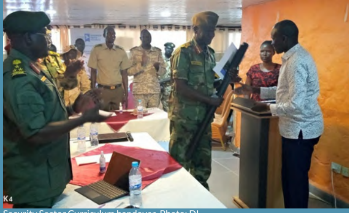
Security Sector Curriculum handover.