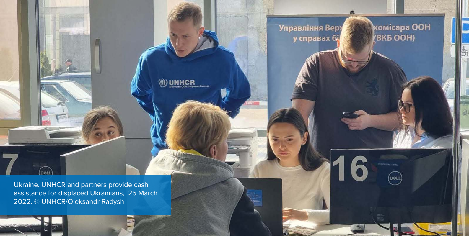
Ukraine. UNHCR and partners provide cash assistance for displaced Ukrainians, 25 March 2022.