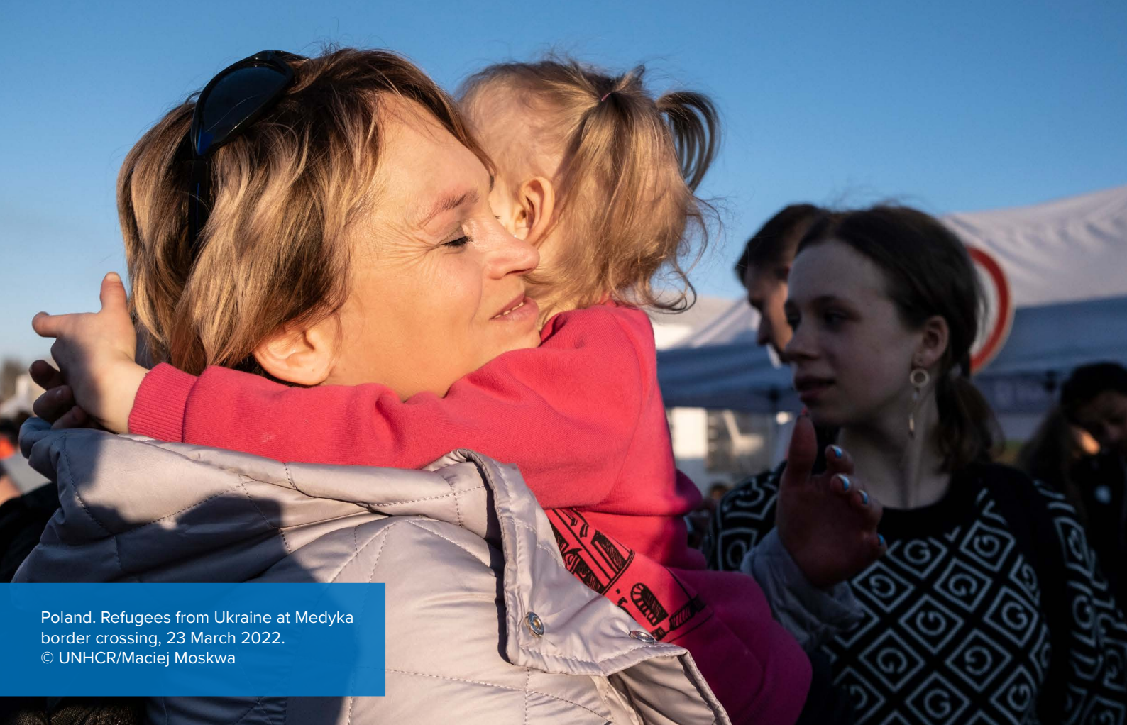
Poland. Refugees from Ukraine at Medyka border crossing, 23 March 2022.