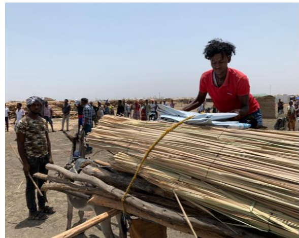
Refugees receiving ESKs in Tunaydbah to strengthen their shelters against weather elements