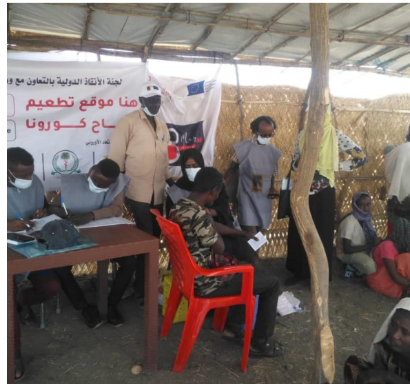
Refugees receiving a dose of COVID-19 vaccine in Tunaydbah as part of a new round of vaccination campaign

A new round of vaccination is held to protect refugees against COVID-19: A total of 13,147 refugees received a dose of the COVID-19 vaccine – 3,015 their first dose and 10,132 their second dose – in a new round of vaccination campaign in Babikri, Tunaydbah, Um Rakuba and Village 8 led by the Ministry of Health and IRC, in collaboration with UNHCR. With this, the cumulative number of refugees who received the first dose reached 20,872 , representing 45 per cent of the target population of 18 and above while the 10,132 who were vaccinated with the second dose constitute 21 per cent of the target population.