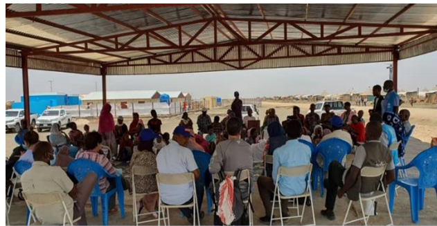
Community meeting with refugees in Tunaydbah