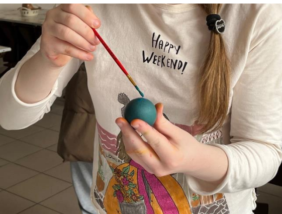
Refugee children painting Easter eggs with a hope to be home again.