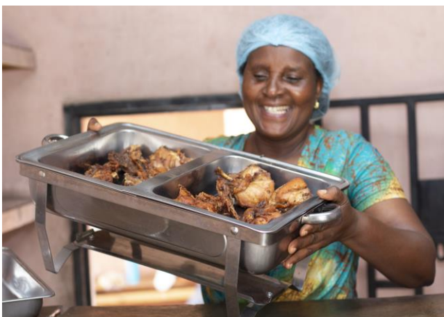
An Urban beneficiary of UNHCR'S Women and Girls at Risk Empowerment Programme in Lusaka administered by UNHCR's livelihoods partner Caritas Czech Republic (CCR)