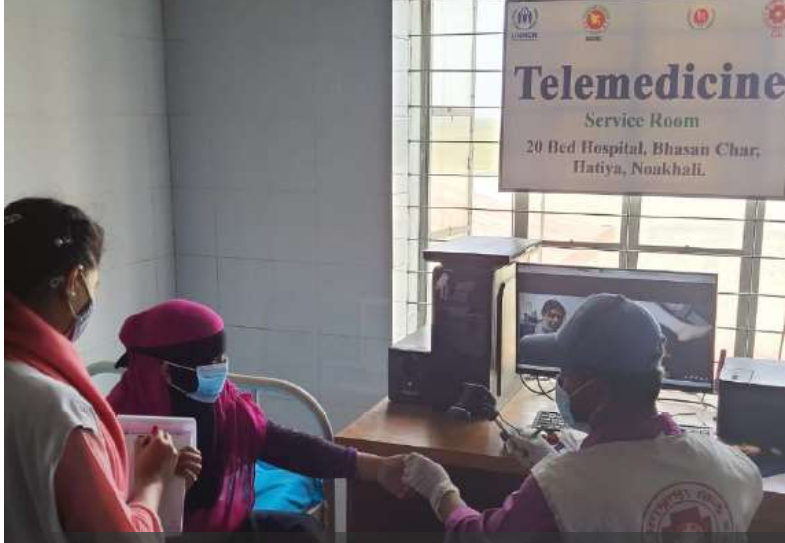
UNHCR is providing telemedicine services to the refugees living on Bhasan Char.