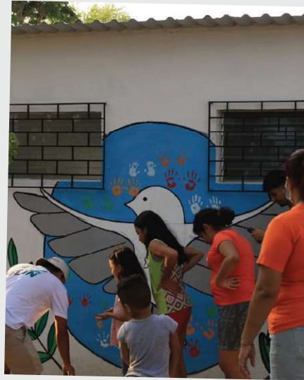
* Name changed for protection reasons

Grecia*, a community leader in Soyapango municipality, is well aware of the challenges of living in a community stigmatized by violence. She's still convinced that recovering public spaces through sports and recreational activities are key for the future of the community. "These spaces serve to enhance personal skills and benefit the development of each member of the community." In San José community, UNHCR renovated a soccer field, installed lights, benches, and children's games, and built inclusive public bathrooms. In Conacastes neighbourhood a similar intervention included a multipurpose field, an outdoor gym and children's playground. "Negative energies can be channelled here. I feel I can steer fear and stress, instead of resorting to violence" insists Grecia*. Both projects were possible thanks to the support of flexible funds and the involvement of community members in mapping needs, choosing the spaces, and committing to maintain them.