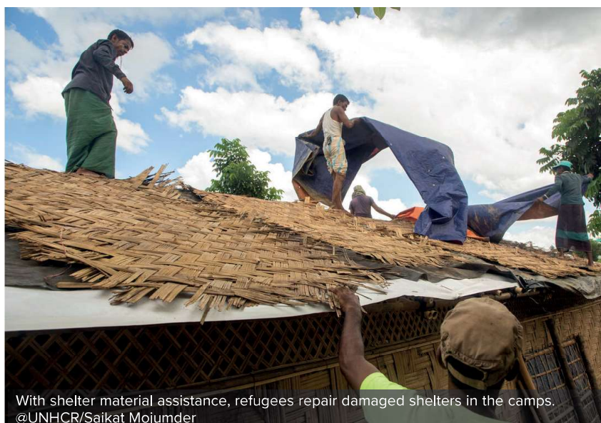
With shelter material assistance, refugees repair damaged shelters in the camps.

UNHCR and its partners design and construct a range of facilities in the refugee camps and in local areas to improve service delivery. A new outpatient department complex is under construction at Sadar District Hospital in Cox's Bazar town which is expected to be completed by June 2022. UNHCR is also constructing the Ukhiya Specialized Hospital which will be completed by the end of April 2022. Both facilities will provide health services for refugees and local Bangladeshis. In the camps, several facilities have been designed and constructed including nutrition centres, warehouses and depots for the safe storage and distribution of gas cylinders used for refugee cooking. To support the security forces in the camps, the design and construction of five barracks for the Armed Police Battalion (APBn), who are responsible for safety and security of refugees in the camps, are ongoing.