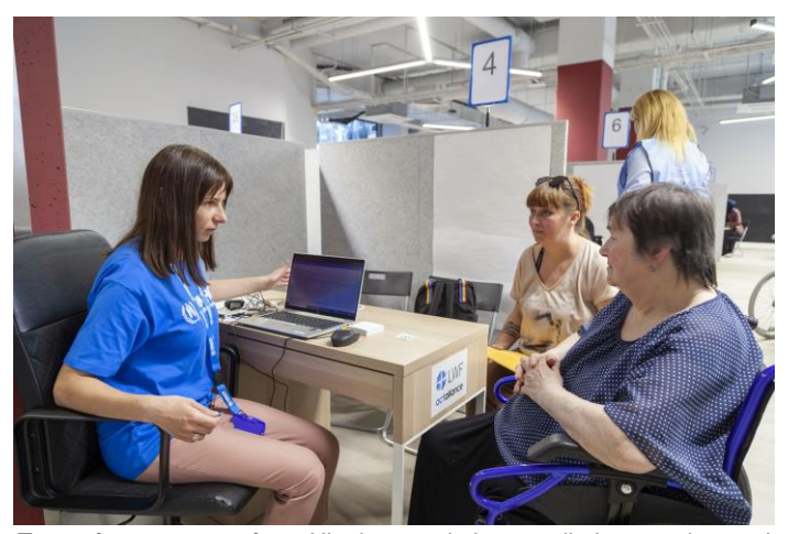
Two refugee women from Ukraine are being enrolled to receive cash assistance from UNHCR at the cash enrolment centre in Wroclaw, Poland. © UNHCR/Rafal Kostrzynski, 20 May 2022

UNHCR has boosted its presence and response to provide life-saving cash assistance, protection, and solutions, to support the Government-led efforts.