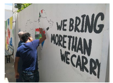
World Refugee Day celebration in Misrata.

As part of events to mark World Refugee Day (WRD) in Libya, UNHCR and the Libyan Scouts organized an event on 17 June for local communities, including displaced Libyan and refugee children, to strengthen social cohesion and provide a safe space for children to play and learn together. A range of educational and recreational activities was held, including drawing, theatre, games, and dental health awareness.