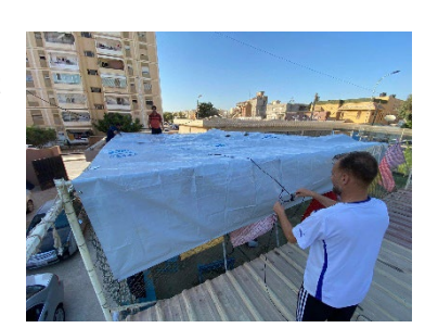
Plastic tarpaulin sheets donated by UNHCR.

UNHCR and partner organisations continue to provide assistance to internally displaced Libyans and host communities. UNHCR donated plastic tarpaulin sheets to help children with learning difficulties take part in outdoor activities in the shade. The sheets were donated to the group, Mentally Disabled Friends, helping displaced Libyan and non-Libyan youngsters with Down's syndrome in Benghazi. UNHCR, through partner LibAid distributed core relief items to 129 displaced families (679 individuals) in Zawya. UNHCR through partner LibAid also distributed male and female hygiene kits to 1,100 families (4,930 individuals) in eight Benghazi Tawerghan IDP settlements.