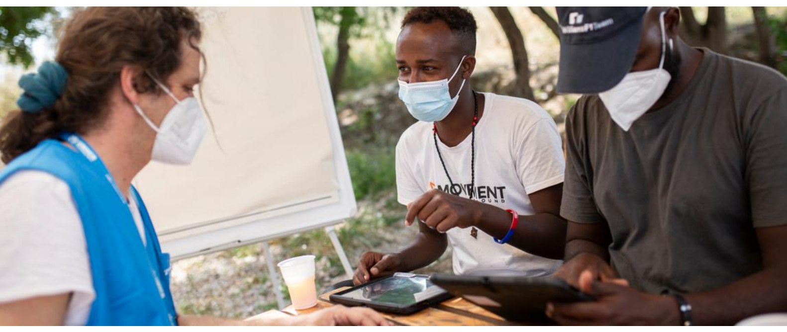
Outreach volunteers during a training session with UNHCR expert in VIAL site on Chios.