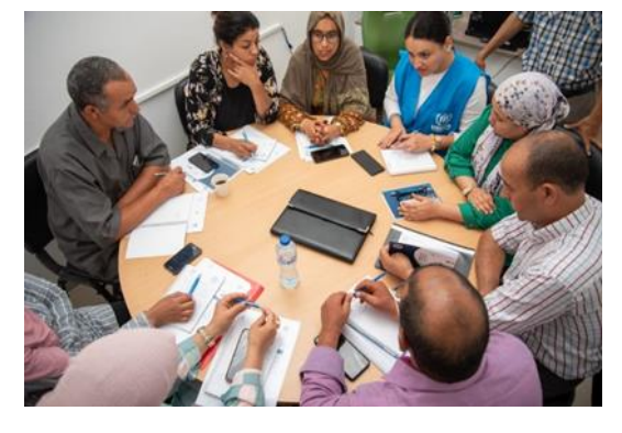
Workshop with partners on Education for refugee children-Medenine.

On 21 June, UNHCR and partners organized a workshop with counterparts from the Ministry of Education, Ministry of Women and Child Development, Ministry of Social Affairs, and local psychologists in Medenine Governorate. The aim of this workshop was to strengthen collaboration for protecting refugee