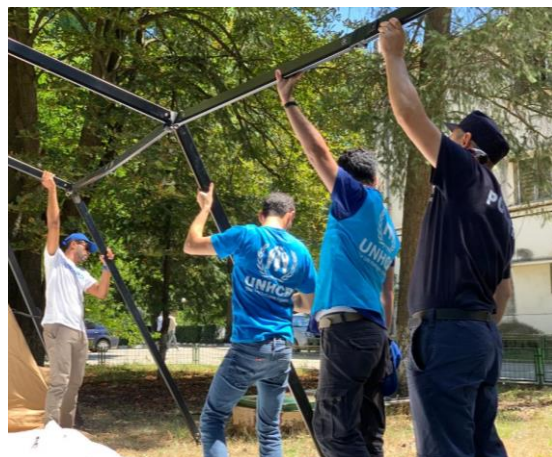
Tent mounting training held on 15 July 2022

UNHCR, along with its partner CNRR, co-facilitated a workshop on legal provisions relating to asylum organized in Predeal for 36 state and non-state actors. Discussions were focused on the European Court of Human Rights jurisprudence on asylum and UNHCR's role in reviewing asylum decision jointly with the General Inspectorate for Immigration through quality mechanism.