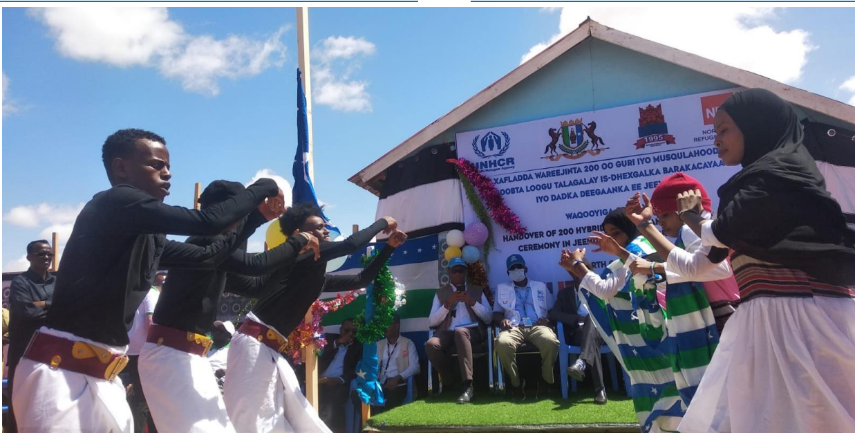
Youths performing a dance routine during the handover of 200 shelters with land title deeds in Jeehdin local integration site in Galkayo, Puntland.