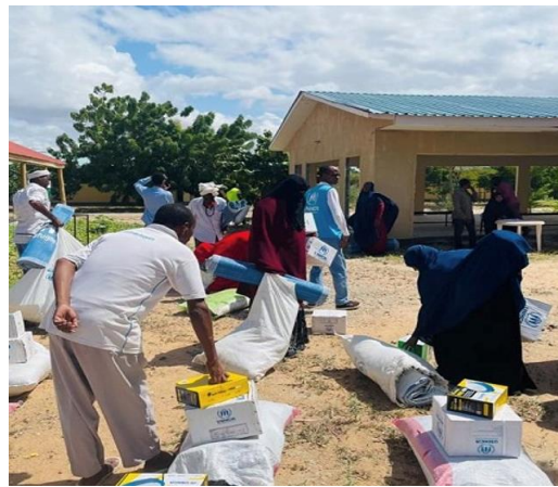
Drought-affected IDPs receiving NFIs in Dhobley, Jubaland.