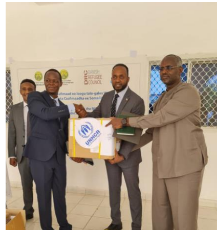
Handover of medical items to the Ministry of Health Development in Somaliland.