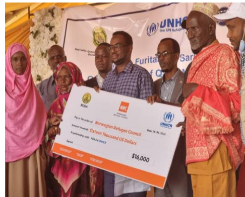
Handover of a symbolic check for the 32 business grant recipients in Qalax Somaliland.