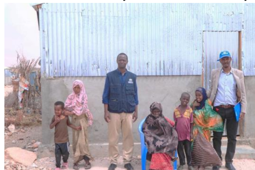
UNHCR staffs handing over a newly built shelter to an IDP family in Nasahablood C settlement of Hargeisa, Somaliland.