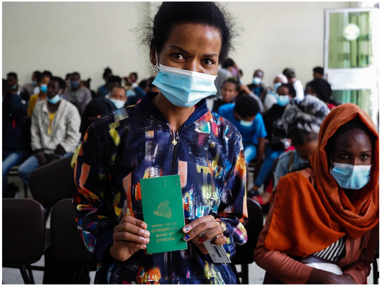
ETHIOPIA. 4 August 2021, UNHCR and Ethiopian officials register Eritrean refugees in Addis Ababa.