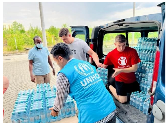
Distribution of water near Iasi, Romania

During the week, UNHCR in Suceava distributed 988 family hygiene kits and 1,248 individual hygiene kits to different governmental and non-governmental organisations (NGOs). Municipalities and NGOs supported the distribution process by reaching out to refugee families living in the community. In addition, hygiene kits were distributed in Tulcea and Galati to over 300 refugees.