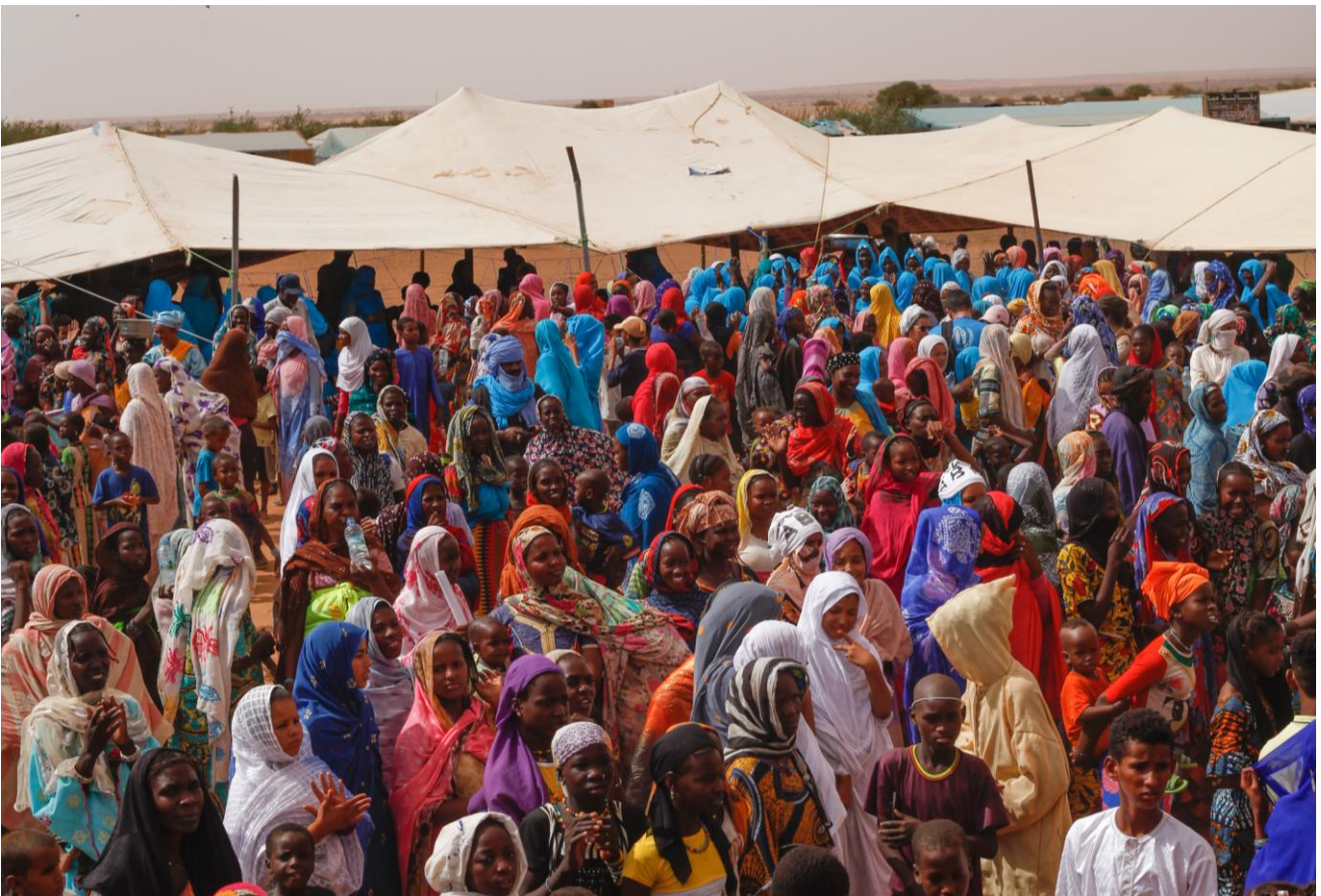
Mauritania. World Refugee Day celebrations in Mbera Camp, where almost 80,000 refugees have safe access to food, water, healthcare, education, and the chance to build a bright future. 20 June 2022.

This year's World Refugee Day theme centred on the fundamentals of international refugee protection with the slogan: Everyone has the right to seek safety.