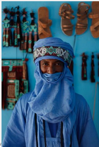
Mauritania, Nouakchott. June 2022