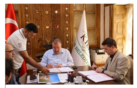
UNHCR and Kilis Municipality sign a Letter of Understanding in Kilis.

The Representative was on mission to the southeast region of Türkiye, in Kilis, Gaziantep, Mardin and Şanlıurfa during the first week of July. In addition to meeting governors, provincial directors of migration management, mayors, and visiting verification and voluntary repatriation processing areas, the Representative also met with staff, partners, and university representatives, and visited livelihoods and social cohesion projects implemented by UNHCR and partners. The Representative also signed a Letter of Understanding with the Mayor of Kilis to strengthen the ongoing partnership between UNHCR and Kilis Municipality for the protection and provision of services to people in need of international protection in Kilis and to support social cohesion among the communities. Kilis is the province in Türkiye with the highest proportion of Syrians to the Turkish population.