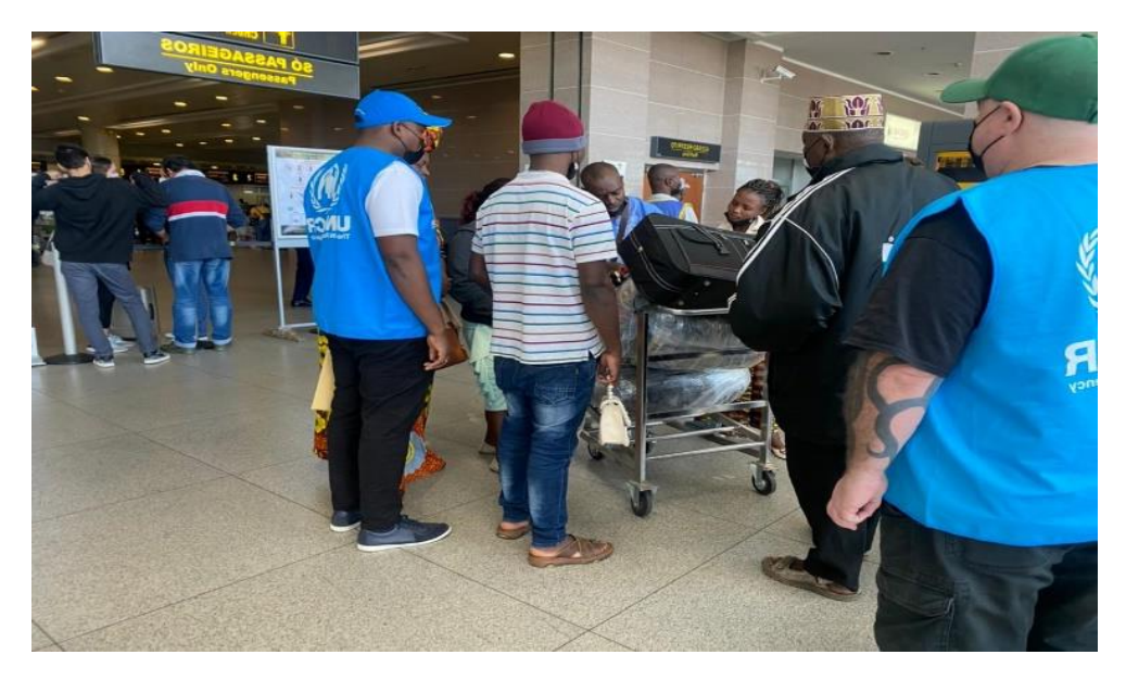
UNHCR Assisting VolRep at Maputo Airport