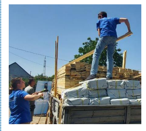
Shelter Kit material offloaded from a truck in Odeska oblast