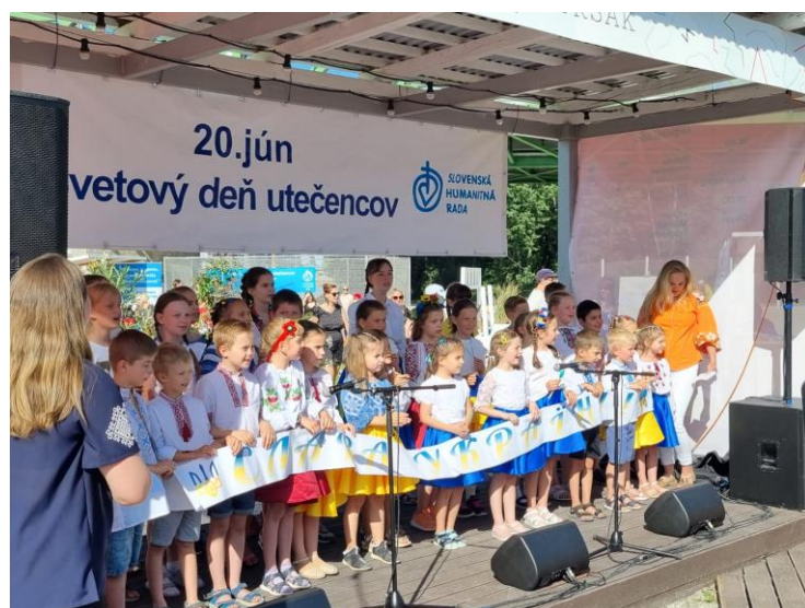
Children at the World Refugee Day event in Bratislava.

UNHCR has boosted its presence to support coordination for the response, provide protection, life-saving cash assistance, and other support in line with the Government-led efforts.