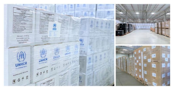
Pre-positioned aid materials in UNHCR warehouse near Bucharest, Romania.

UNHCR has pre-positioned over forty types of core relief continue materials to supporting the national response, including with foreseeable additional needs related to the winter season. UNHCR works closely with Department Emergency Situations (DSU) and UN Agencies to ensure a coordinated and harmonized response.