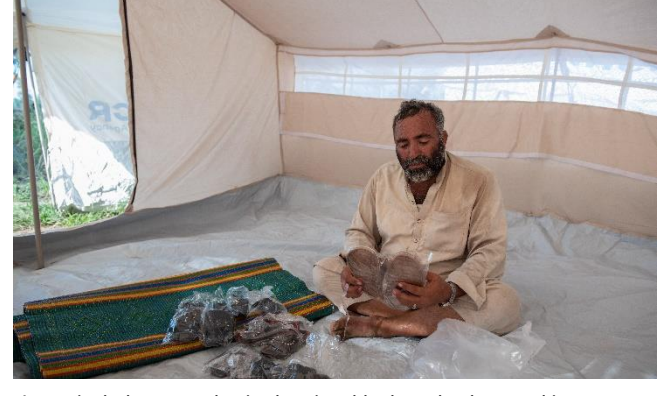
Items include tents, plastic sheeting, blankets, buckets and jerry cans \ensuremath{@} UNHCR Pakistan

(Balochistan province). In addition, 1,317 long-lasting insecticidal nets were also distributed to flood-affected communities residing in Khazana, Shamshatoo and Kheshgi refugee villages (Khyber Pakhtunkhwa province).