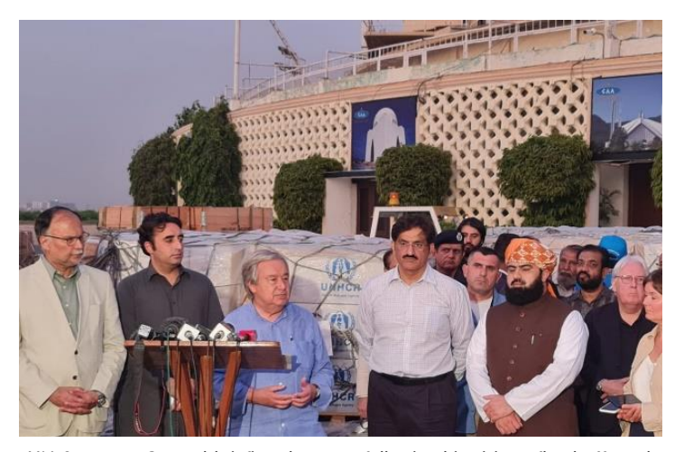
UN Secretary-General briefing the press following his visit to flood-affected communities

The United Nations Secretary-General (UNSG) Mr. António Guterres visited Pakistan from 9-10 September. During his visit, the UNSG met with government officials, including the Prime Minister and Minister of Foreign Affairs, United Nations Country Team, and flood affected communities in Sindh and Balochistan provinces. The UNSG used his visit to raise awareness of the devastation caused by unprecedented rains, flash flooding and rain-induced landslides. He concluded his visit by reiterating the international community's obligation to ramp up their action on the climate crisis and appealed for greater financial support and responsibility sharing by countries that have contributed more to climate change for relief, rehabilitation and reconstruction in Pakistan.