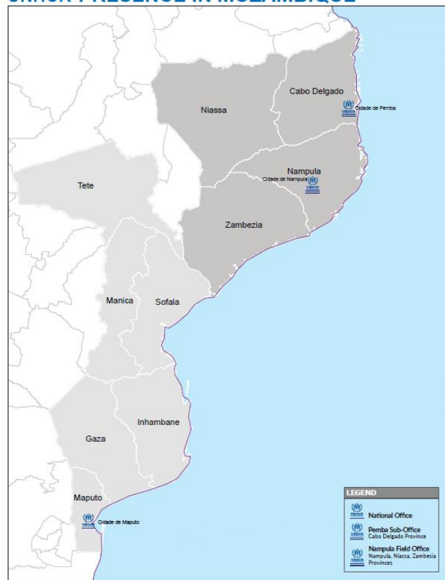
The boundaries and names shown and the designations used on this map do not imply official endorsement or acceptance by the United Nations. Creation date: 01 August 2022. Sources: UNHCR Feedback; mcswenee@unhcr.org

Staff: 117 70 National staff 47 International staff