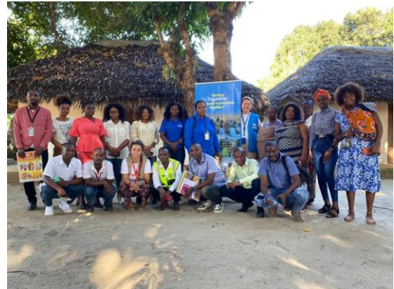
GBV and PSEA training in Palma.