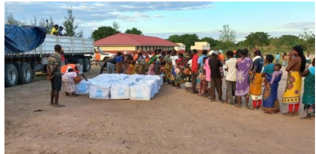
Families queuing to receive CRIs in Zambezia Province.