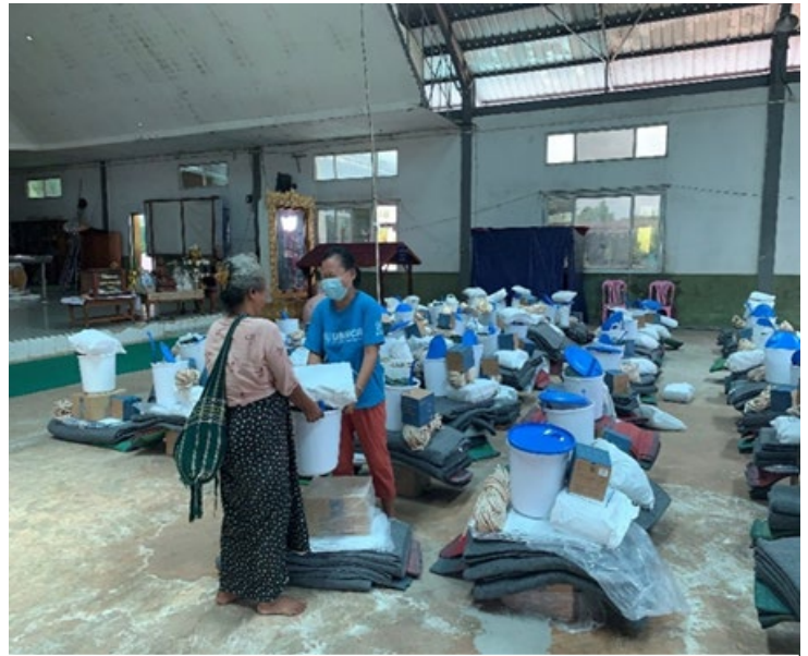
A displaced woman receiving relief items in Kayin State