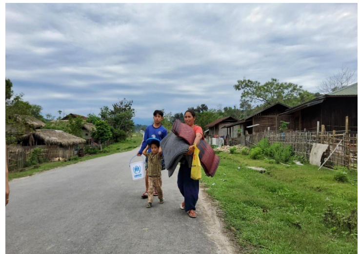
UNHCR and its partners are providing relief items to IDPs in Kachin State