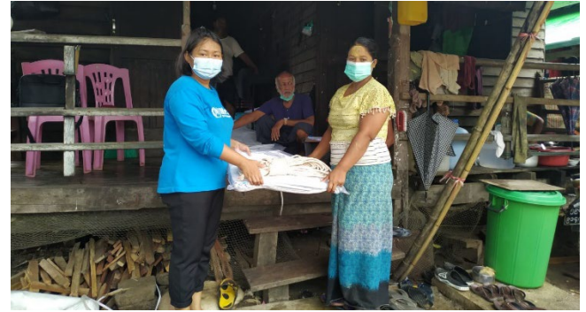
UNHCR and its partners are providing emergency shelter materials to displaced families in Rakhine State