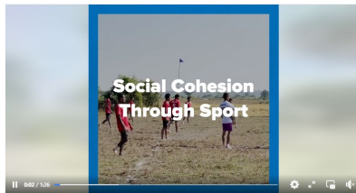
[VIDEO] Social Cohesion through Sports in Rakhine