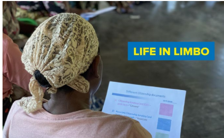
[ARTICLE] Life in limbo