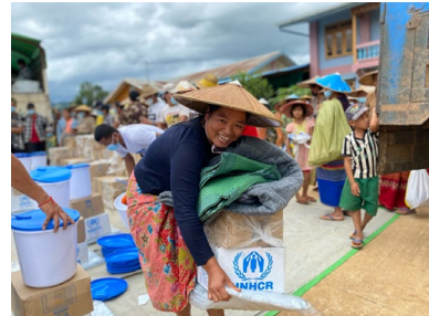
[ARTICLE] Op-ed for World Refugee Day 2022