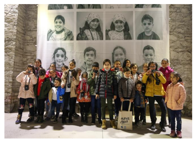
Syrian children posing with their cameras at the exhibition hall where photographs taken by them were displayed.

In 2021, a refugee desk was established in Şehzadeler District Municipality in Manisa with the support of UNHCR. The refugee desk conducted outreach visits to identify persons with specific needs and to promote the inclusion of refugees in available services in Şehzadeler . Within the year, over 1,100 individuals were reached through home visits.