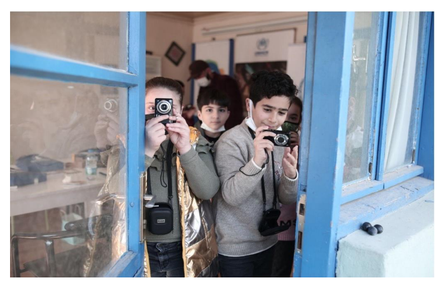
Refugee children practicing photography techniques learnt at the photography training through joint efforts of Izmir City Council and UNHCR.

UNHCR's coordination efforts to support the refugee response in the field remained crucial to avoid duplication and gaps in international assistance. Considering the protracted COVID-19 situation and deteriorating conditions for refugees, in addition to inter-sector coordination platform, dedicated working groups were established for child protection and gender-based violence as well as protection and basic needs sectors for an in-depth elaboration of specific needs and to coordinate an appropriate response with partners in the region.