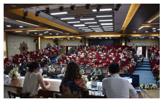
Information and awareness-raising session in Manisa

UNHCR carried out information sessions targeting refugees for the purpose of raising awareness and knowledge on GBV prevention, mitigation and response mechanisms in Türkiye as well as their rights and obligations.