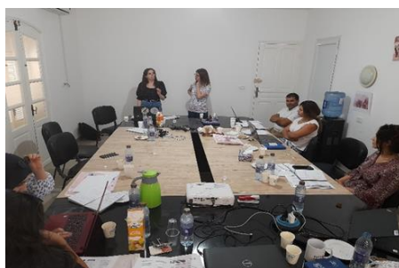
GBV training for CTR in Medenine.

A group of demonstrators asking for evacuation from Tunisia has been blocking the entrance to UNHCR office in Tunis, since 7 August, leading to a disruption of protection services . While tensions have been slightly eased following multiple meetings between UNHCR and the group of demonstrators, the blockage has prevented some persons of concern to access protection services such as registration, and status determination. UNHCR subsequently held remote counselling sessions with individuals to continue assessing the situation and exploring solutions.