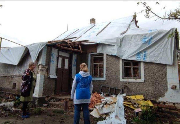
Emergency shelter kits delivered to protect damaged homes in newly accessible villages of Khersonska oblast. Residents with destroyed homes received essential items such as mattresses and sleeping bags. September 2022.