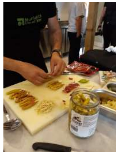
Photo caption: Professional chefs cooking different dishes with the okra harvested under the Urban Agriculture Project.