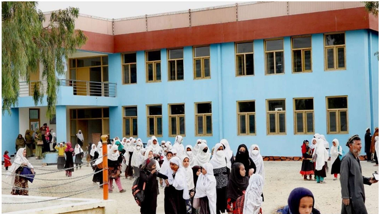
Kutobzai Girls High School constructed by UNHCR in Mehteriam District, Laghman Province

As part of the inter-agency efforts, UNHCR has reinforced its operational presence on the ground, and continues to support affected communities through emergency activities such as the distribution of emergency shelter tents, non-food items and dignity kits for vulnerable women and girls. The epicenters of the recent flashfloods were in the provinces of Uruzgan, Kandahar, Zabul, Paktika, Ghazni, Logar, Khost, Paktya, Nangarhar, Laghman, Kunar and Nuristan.