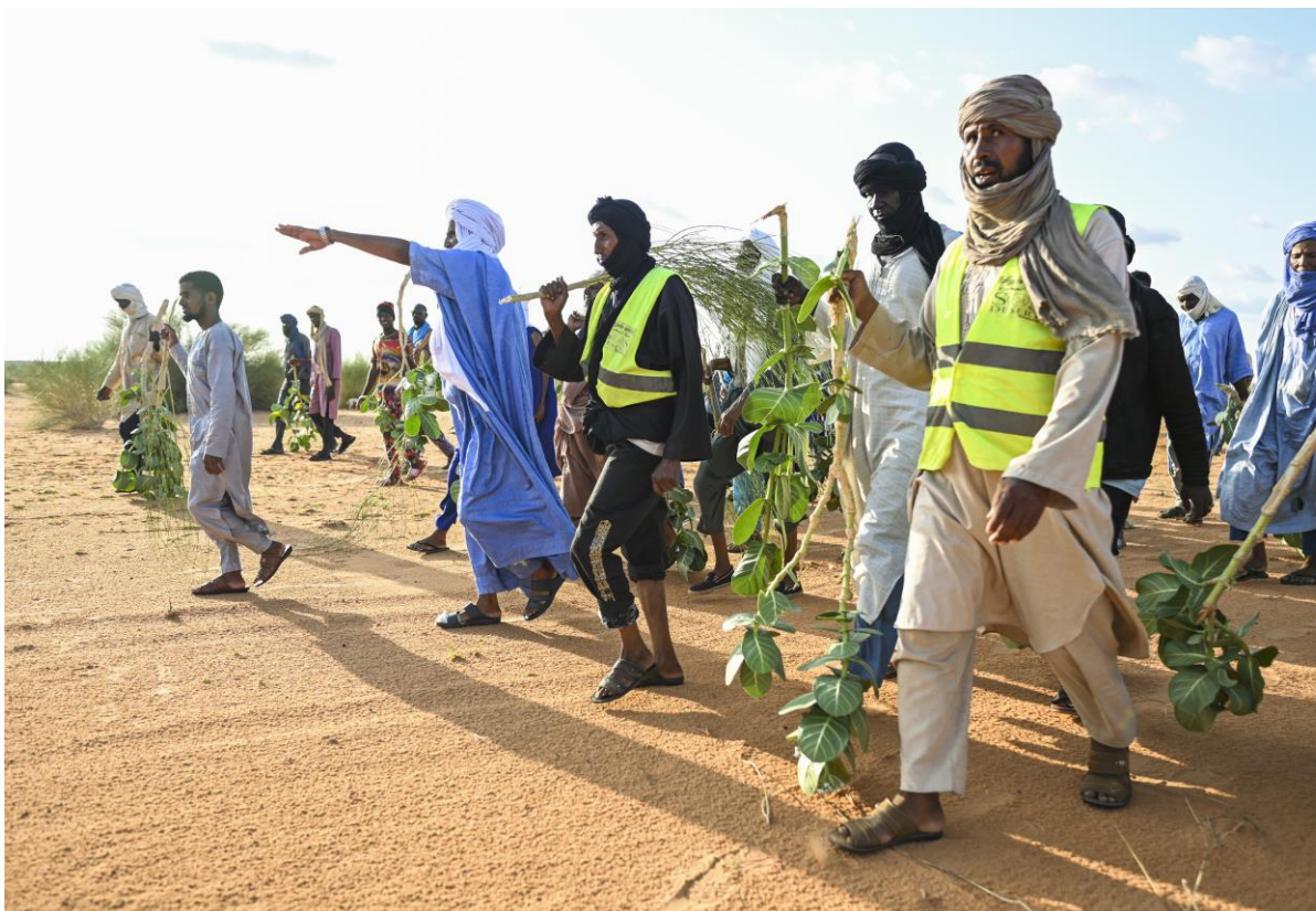
Mauritania. Mbera Fire Brigade honoured for environmental activism.