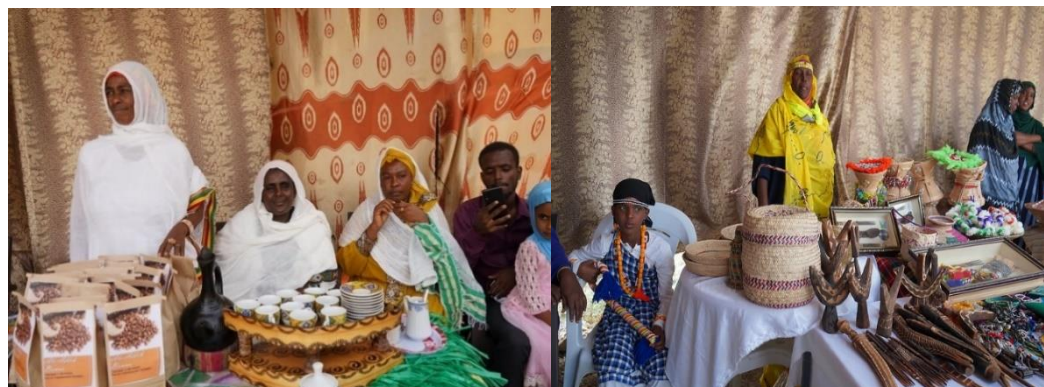
World Refugee Day 20 June 2022 – refugees displaying their knowhow through handicrafts