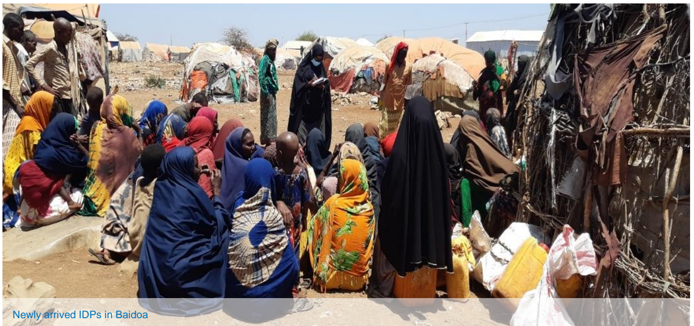
Newly arrived IDPs in Baidoa

The PRMN (Protection & Return Monitoring Network) is a UNHCR-led project which identifies and reports on displacements as well as protection risks and incidents underlying such population movements. On behalf of UNHCR and the Norwegian Refugee Council (NRC), 38 local partners in the field in Somalia (South Central regions, Puntland and Somaliland) undertake data gathering (primarily through interviews with affected communities and key informants) and monitoring at strategic locations.