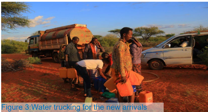
Figure 3: Water trucking for the new arrivals

PRMN is a UNHCR-led project which identifies and reports on displacements as well as protection risks and incidents underlying such population movements. On behalf of UNHCR and the Norwegian Refugee Council (NRC), 38 local partners in the field in Somalia (South Central regions, Puntland and Somaliland) undertake data gathering (primarily through interviews with affected communities and key informants) and monitoring at strategic locations.