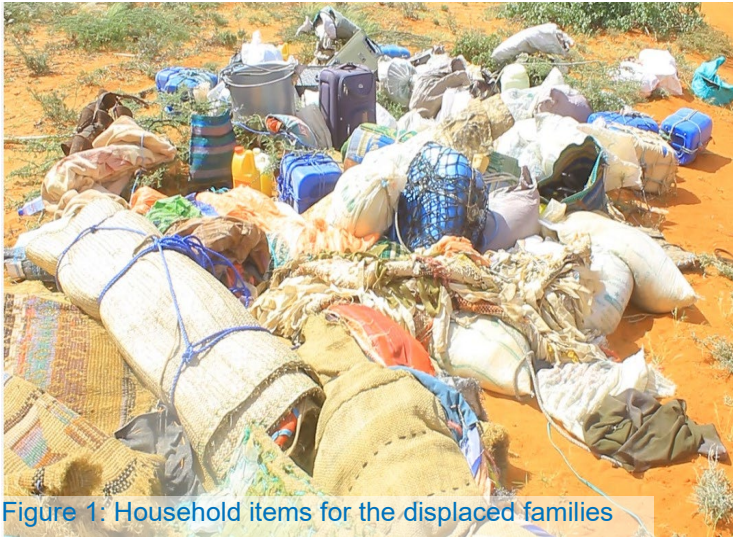
Figure 1: Household items for the displaced families