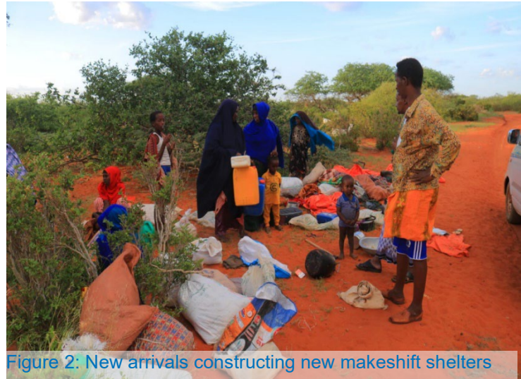
Figure 2: New arrivals constructing new makeshift shelters