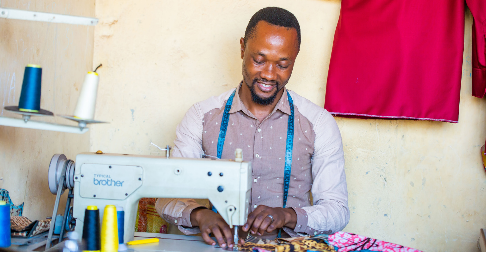
A refugee tailor at work in Kampala. The textiles sector is a popular livelihoods activity among refugees and hosts in Kampala and Nairobi.