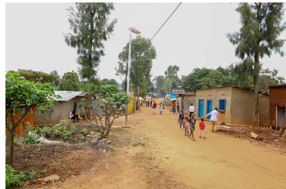
The main market street in Nyabiheke refugee camp