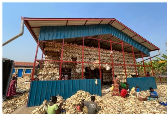
Drying shed built by UNHCR to support refugee and Rwandan farmers working in the Nyabicwamba marshland project