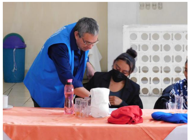
Training provided to individuals assisted by UNHCR in Huehuetenango.