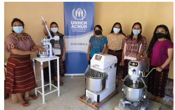
UNHCR and its partners donated equipment to the Municipal Training Centers in Huhuetenango.