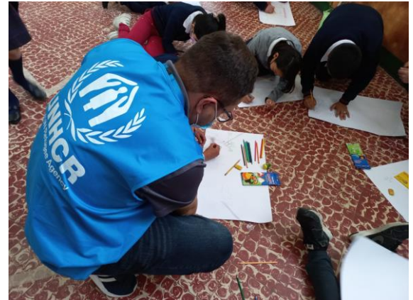
Social and peaceful coexistence activities with students in Huehuetenango.