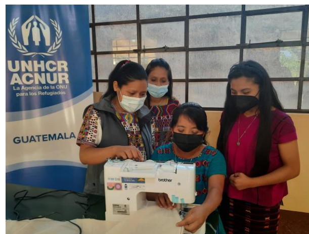
Female entrepreneurs assisted.