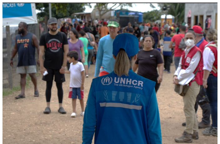
Panama. Unprecedented number of refugees and migrants crossing the Darien Gap in search for safety and protection.