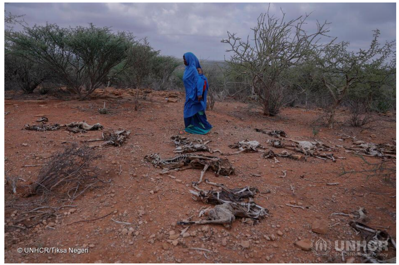
An internally displaced woman in Ethiopia has seen her livestock & livelihoods disappear due to the worst drought in decades and is now facing extreme food insecurity.