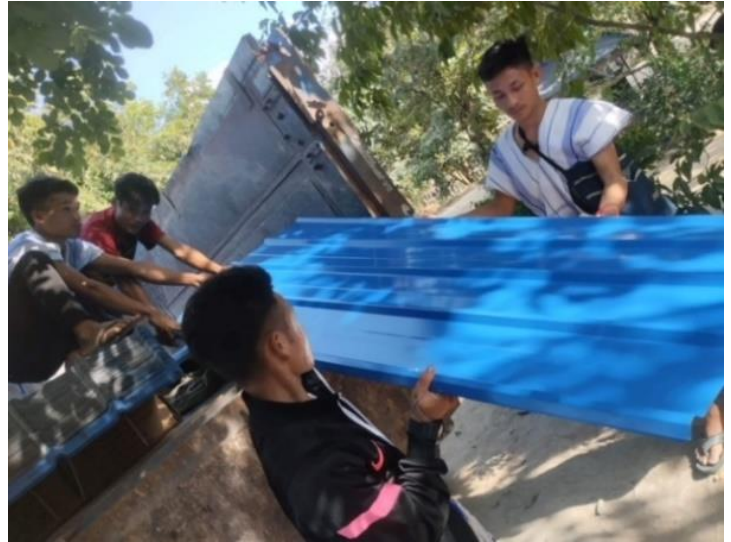
UNHCR and partners distributing shelter materials in Bago (East) Region