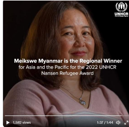
[ VIDEO ] Meikswe Myanmar, UNHCR Nansen Award 2022 regional winner for Asia and the Pacific assist communities in need