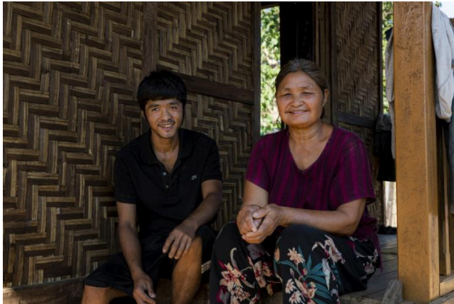
[ STORY ] Empowering Displaced Communities in Myanmar's Northeast