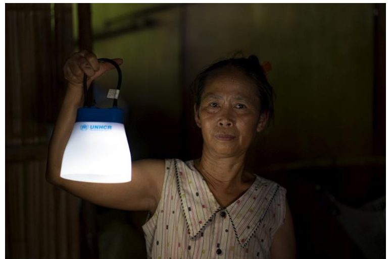
A woman holds a solar lamp provided by UNHCR inside her home in Shan State (North)