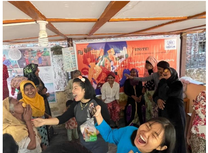
Community members participating in the 16 Days of Activism against Gender-Based Violence campaign in Rakhine State