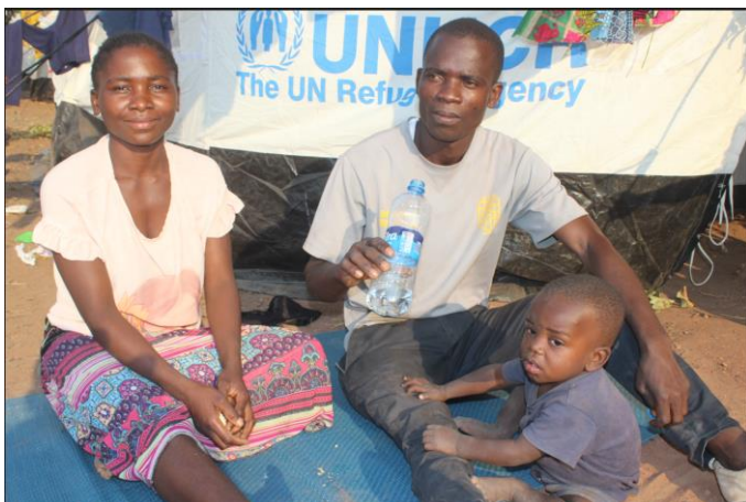
A Congolese refugee family at their homestead in Mantapala settlement ©UNHCR/Bruce Mulenga.