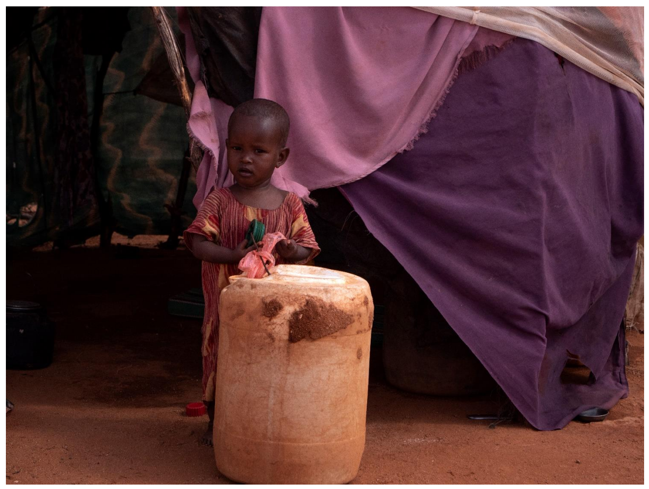
The catastrophic drought ravaging Somalia is putting communities on the brink of famine. Thousands of people have been forced to flee their homes in search of humanitarian assistance including food, shelter, and safe drinking water.