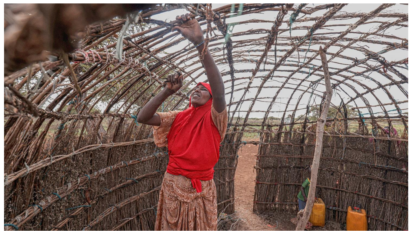
An internally displaced mother sets up shelter after arriving at the Haya Suftu camp in Ethiopia. Hundreds of thousands affected by severe drought and conflict have been displaced in search of food, shelter and water for their families and livestock.