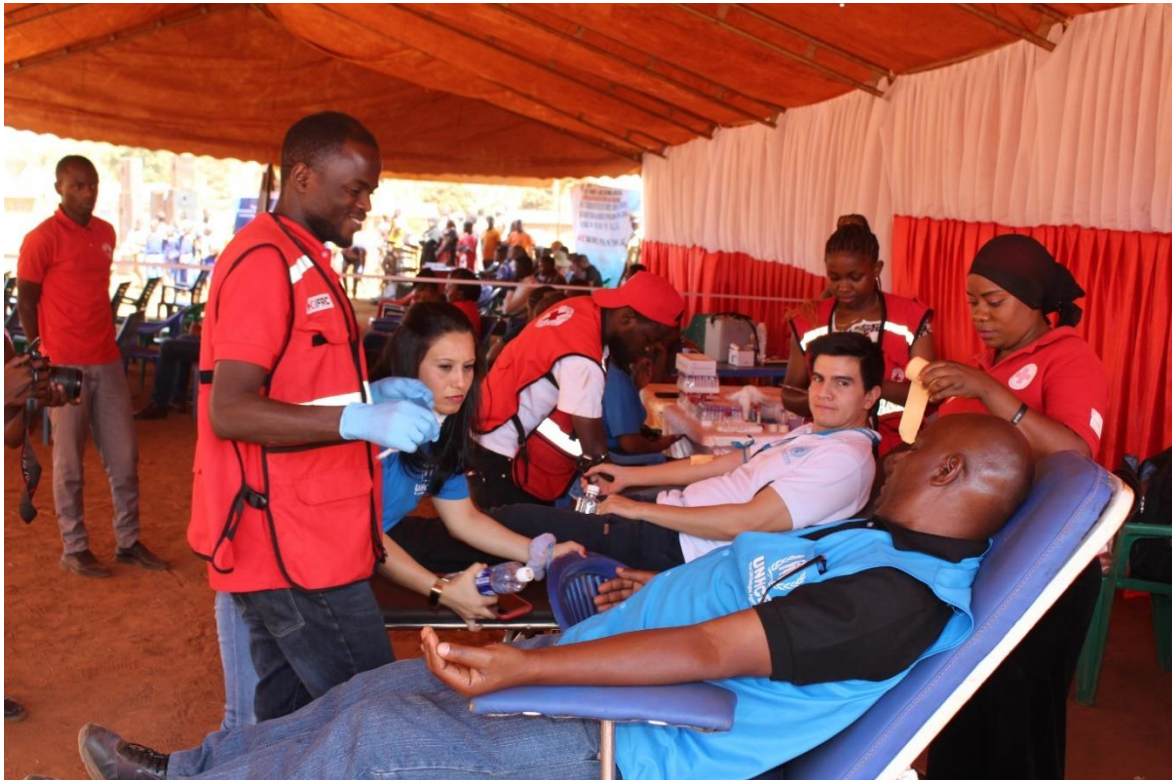
UN staff members donate blood for the UN Day commemorations in Kasulu.