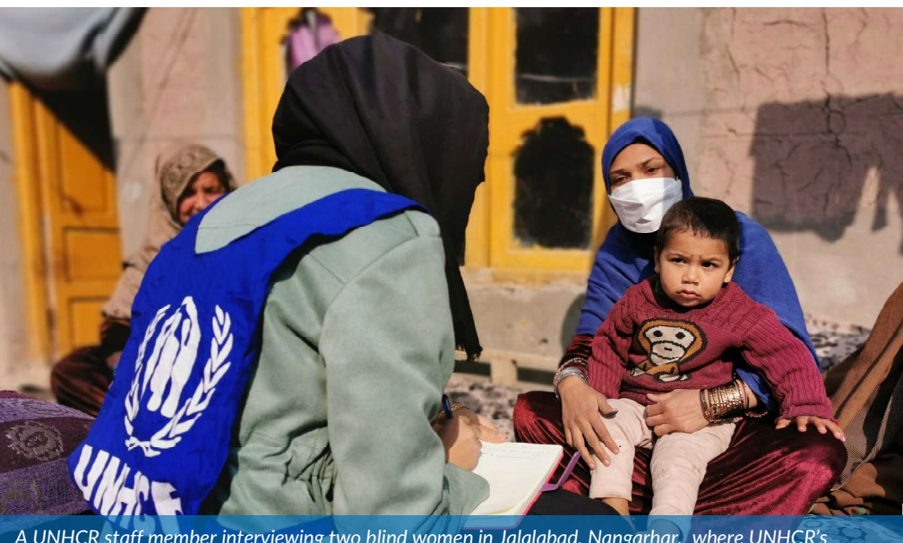
A UNHCR staff member interviewing two blind women in Jalalabad, Nangarhar, where UNHCR's programme to support visually impaired women is currently on hold.

UNHCR distributed blanket cash assistance to 9,975 refugees and asylum seeker households residing in Tajikistan between November and December. This assistance totaled $700,000 and is part of ongoing efforts to expand the systematic use of cash based interventions across operations to support protection and solutions outcomes and service delivery – in line with <u>UNHCR's</u> <u>Policy on Cash-Based Interventions 2022 – 2026</u> and <u>the Grand Bargain commitments</u> made during the 2016 World Humanitarian Summit.