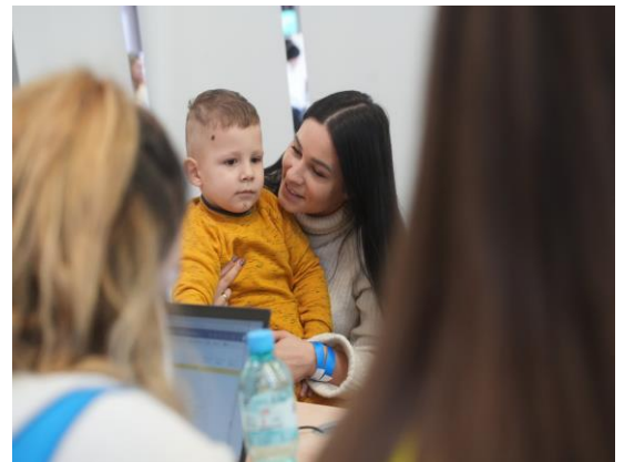
A mother registering for UNHCR's cash assistance at UNHCR's protection desk at the Bottova Registration Centre, in Bratislava.

Temporary Protection since 24 February 2022 104,764 applications for temporary protection status & 95,489 who received temporary protection status (as of 31 December 2022)