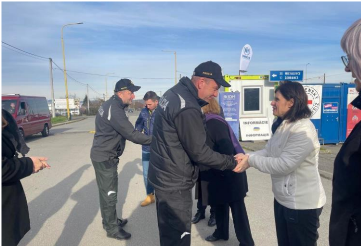
The Head of Košice Field Office greeting the border police at the Vyšné Nemecké BCP.

In 2022, Slovakia saw a rapid influx of refugees fleeing hostilities at its four border crossing points with Ukraine. The majority were women and children and included older people, people with disabilities, and those with urgent medical care needs. While the initial influx has stabilized, the volatile security situation in Ukraine leaves open the possibility of another wave of people crossing the border to Slovakia in the future. Many of those arriving have experienced trauma and distress associated with the conflict and require Mental Health and Psychosocial Support (MHPSS). Border authorities continue to process new arrivals, providing information on temporary protection and asylum, with onward transport available for those seeking to reach urban centres. Information is provided by UNHCR and partner staff at all border crossing points alerting refugees to available