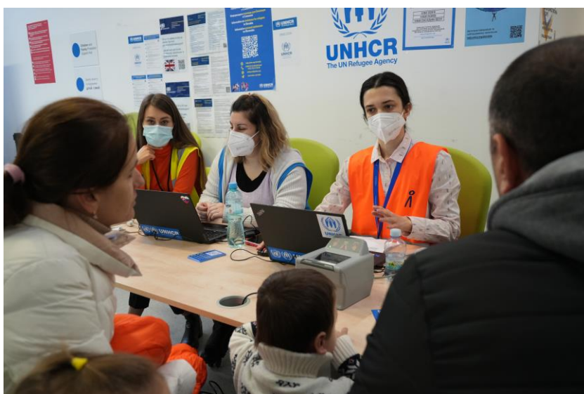
UNHCR and partners conducting registration at Bottova Reception Centre, Bratislava.