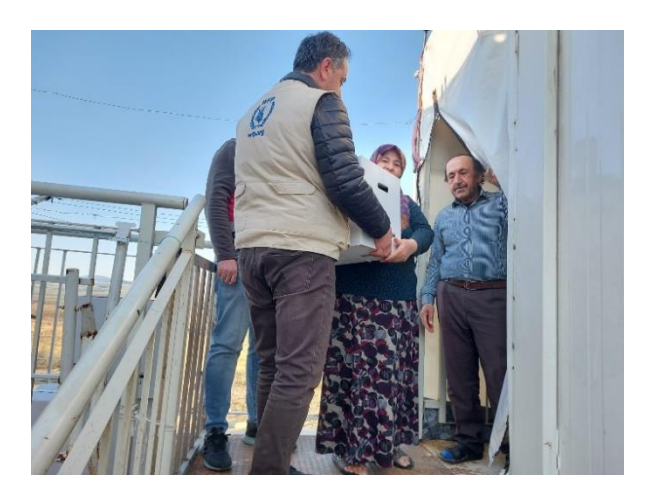
Photo Caption: WFP staff distributing food packages to refugees and IDPs in Cevdetiye camp, Türkiye.